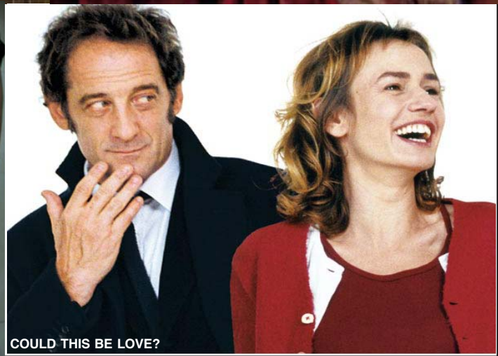
COULD THIS BE LOVE?