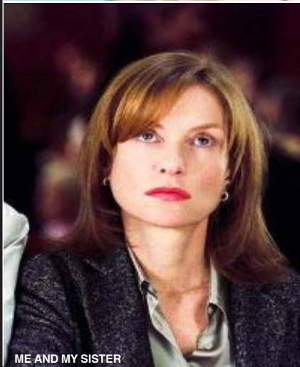
ME AND MY SISTER