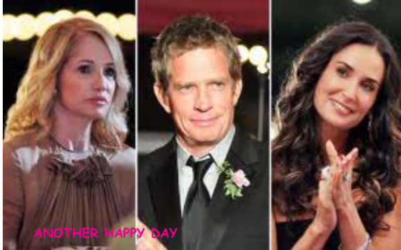
ANOTHER HAPPY DAY