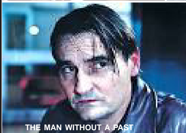
THE MAN WITHOUT A PAST