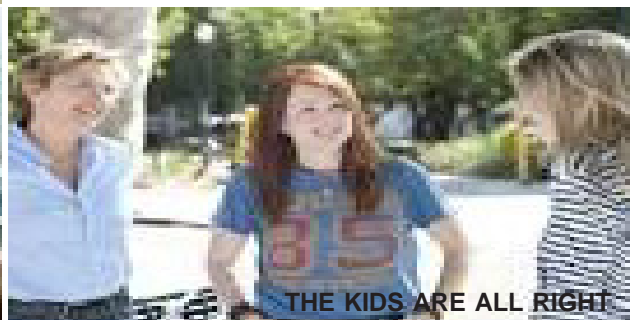
THE KIDS ARE ALL RIGHT