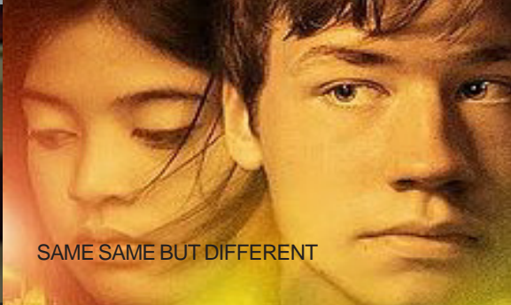
SAME SAME BUT DIFFERENT