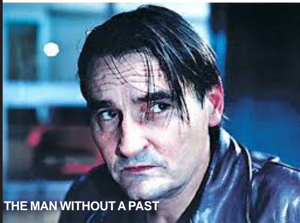
THE MAN WITHOUT A PAST