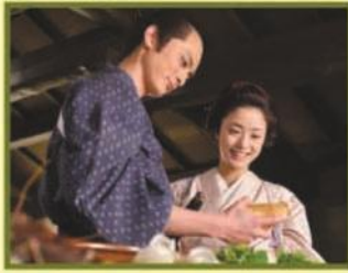
© 2013 "A Tale of Samurai Cooking" Film Partners

22-09-2017, 6.30 PM ● A Tale of Samurai Cooking | 2013 | 121 min ●