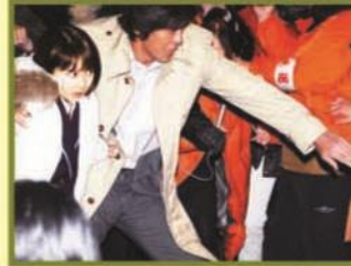
© 2009 FUJI TELEVISION NETWORK, NIPPON EIGA SATELLITE BROADCASTING CORPORATION, TOHO

A deep drama depicting the fears of a modern day society, it portrays the distress of the family of a juvenile criminal and the conflicts of the detective ordered to protect them. The Funamura family is the target of mass media attention after their first son commits act of murder. Furthermore, every move of detective Katsuura takes in protecting the bewildered daughter of the family, Saori is being fully exposed over the internet. In a deadly game of hide and seek Katsuura and Saori are eventually freed from the malicious attempts of internet addicts.