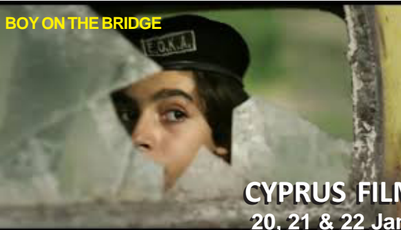
BOY ON THE BRIDGE