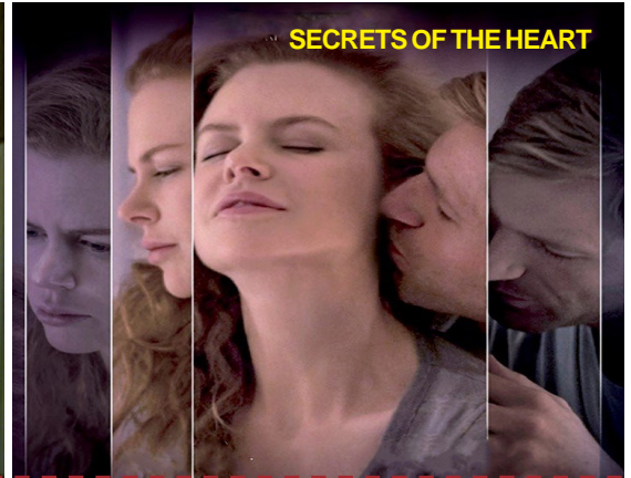
SECRETS OF THE HEART