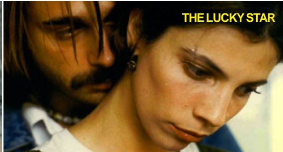
THE LUCKY STAR