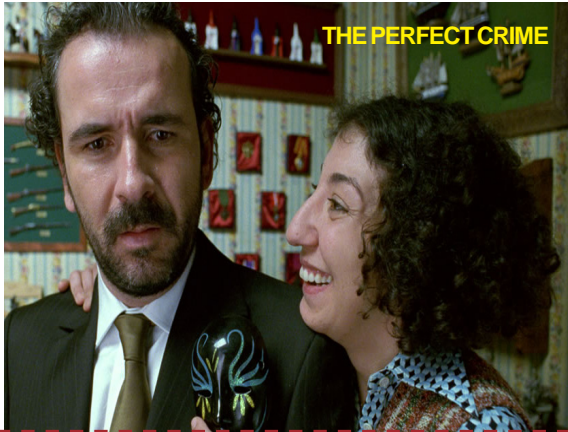
THE PERFECT CRIME