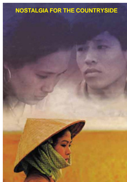
NOSTALGIA FOR THE COUNTRYSIDE